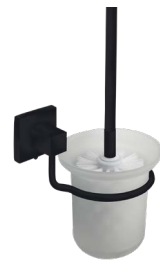
TOILET BRUSH, PAN & HOLDER LR6010BK