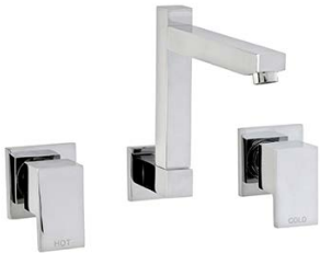
WALL SINK SET P8661BOL 3 STAR 8.0 lit/min