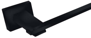
DOUBLE TOWEL RAIL LR6002BK