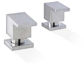
BASIN SET P8660BOL