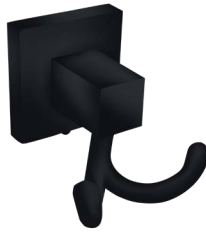
DOUBLE ROBE HOOK LR6006BK