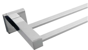
DOUBLE TOWEL RAIL LR6001B

Lauren Project accessories carry a 2 year replacement warranty against fault in manufacture.