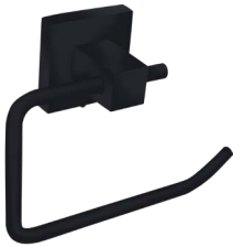
TOILET ROLL HOLDER LR6004BK