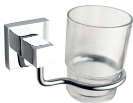
TUMBLER & HOLDER LR6008B