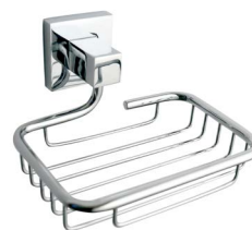
SOAP BASKET LR6007B