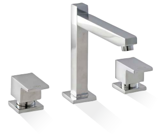
HOB SINK SET P8656BOL 3 STAR 8.0 lit/min