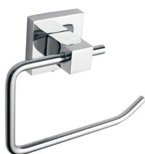
TOILET ROLL HOLDER LR6004B