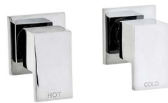
WALL TOP ASSEMBLY P8653BOL