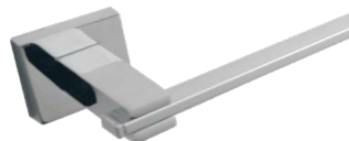
SINGLE TOWEL RAIL LR6002B