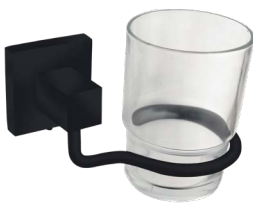
TUMBLER & HOLDER LR6008BK