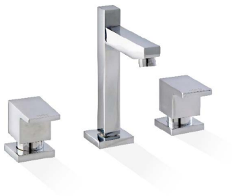
BASIN SET P8650BOL 5 STAR 5.5 lit/min

The Bo Lauren Tapware Range of Tapware carries a 7 year parts and labour warranty.