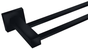
DOUBLE TOWEL RAIL LR6001BK

Lauren Project accessories carry a 2 year replacement warranty against fault in manufacture.