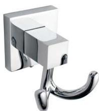
DOUBLE ROBE HOOK LR6006B