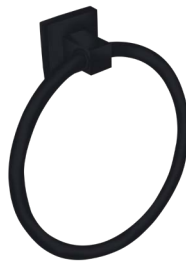
TOWEL RING LR6009BK