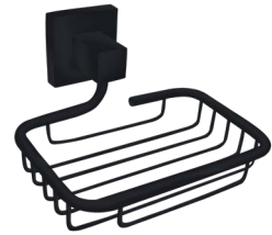
SOAP BASKET LR6007BK