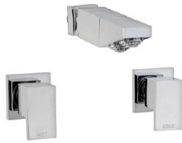
SHOWER SET P8651BOL 3 STAR 8.0 lit/min