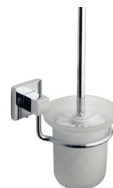
TOILET BRUSH, PAN & HOLDER LR6010B