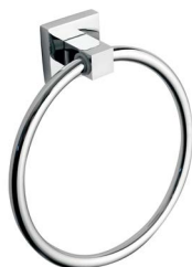
TOWEL RING LR6009B